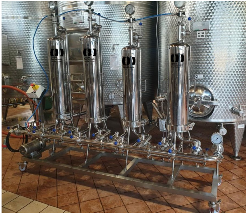
OMflow 11.208m - manual